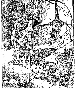
NEW AMERICAN BEAUTY

An American by disposition... The creature shown here... Is a monkey or a nightmare.