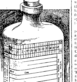
NEW LABEL FOR MEDICINE BOTTLES

The advantage of regularity in taking medicine is said by physicians to be of its great importance as the drugs themselves.