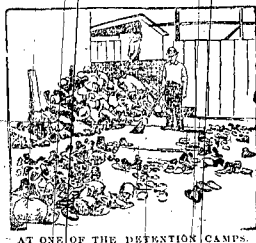
AT ONE OF THE DETROIT CAMPS

A traveler for a shoe firm... Started on a business trip to the Detroit.